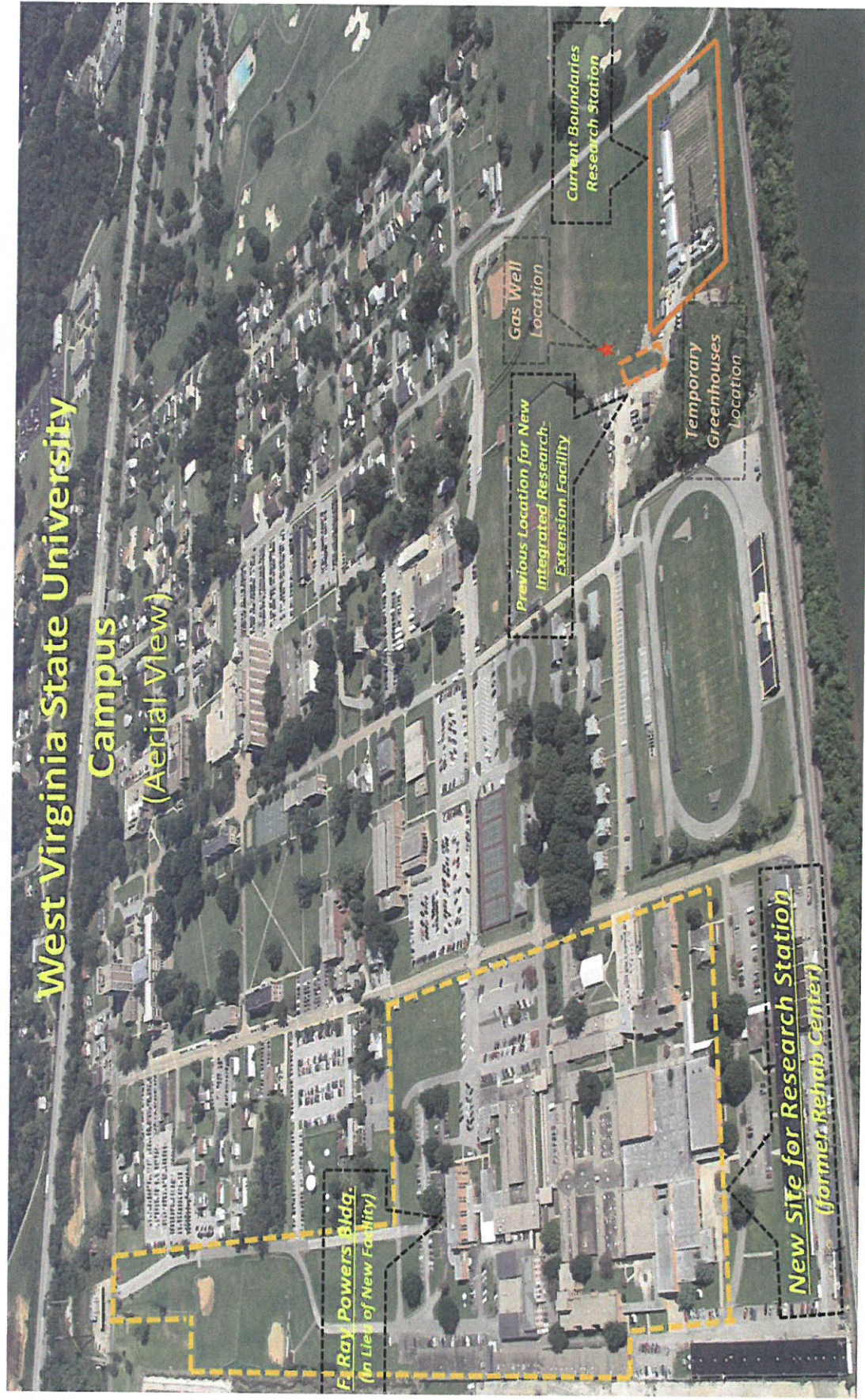
Figure 1: New Campus Site Location for the WVSU Agricultural and Environmental Research Station